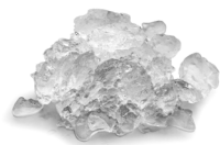
MF 59 Superflake ice Residual water content 15%