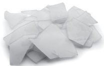
MAR 109 SPLIT Scale ice Residual water content 2% Thickness 1 or 2 mm