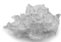
AF 124 Flake ice Residual water content 25%